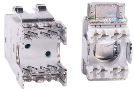
AMP-TWIST-6S SL Jack with AWC termination and patented shield clamp

The Jack fully complies to the Cat. 6 definition of ISO/IEC 11801 2nd Ed. Moreover, it supports 10GBase-T (IEEE 802.3an, standard expected in 2006) over 100 m channels. Consequently, the AMP-TWIST-6S SL Jack is part of Tyco Electronics' AMP NETCONNECT XG Copper solution.